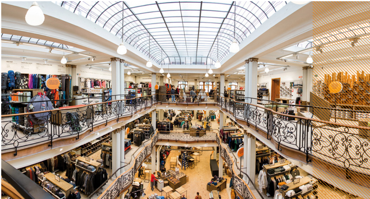
Ghent - Zonnestraat 6-8 - AS Adventure